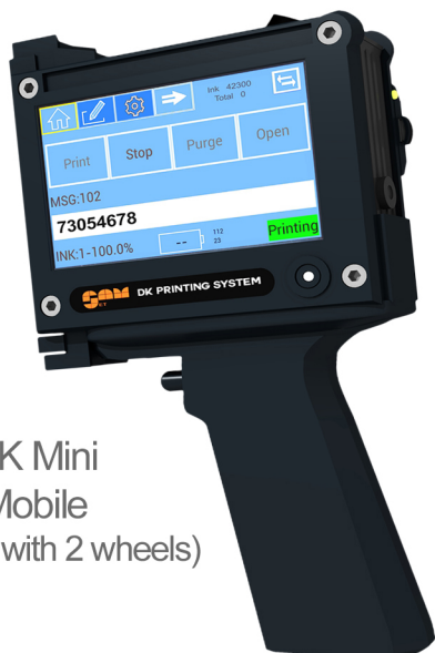
DK Mini Mobile (encoder with 2 wheels)

On the basis of our experiences in the production of Thermal Ink Jet printers, we are glad to announce the introduction of the new FAMJET MAXI Mobiles, innovative portable wireless printing devices able to print on a large range of porous and non porous surfaces, multiline messages in a printing area up to up to 25,4 mm.