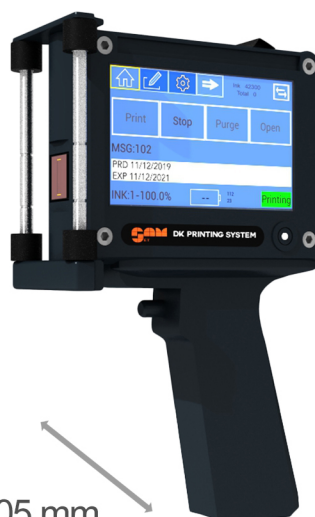
4W Encoder with 4 wheels